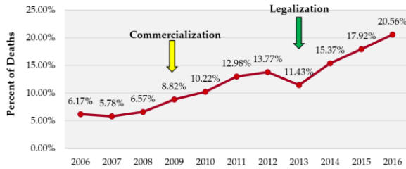
Percent of All Traffic Deaths That Were Marijuana-Related when a Driver Tested Positive for Marijuana